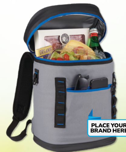
PREMIUM 20-CAN BACKPACK COOLER