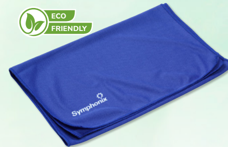
CORETEC CHILLER RPET COOLING TOWEL

Made of recycled PET fiber created from post consumer plastic. Add cool water to activate, simply snap to reactivate.