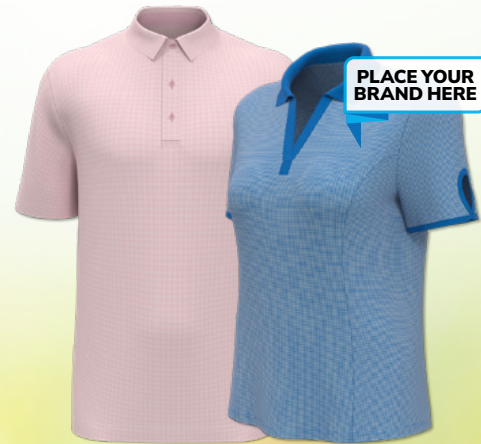
CALLAWAY OPTI-DRI GINGHAM POLO

Ready for spring rain, the waterproof Index Softshell Jacket is designed with a variety of features to keep you comfortable in wet conditions.