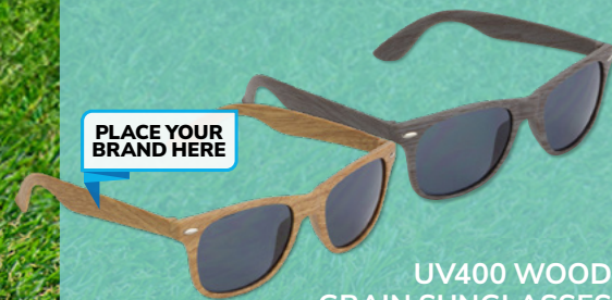
UV400 WOOD GRAIN SUNGLASSES