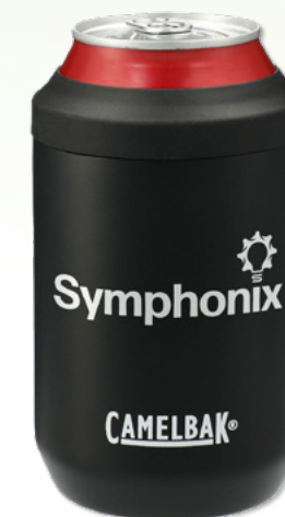
CAMELBAK CAN COOLER 12OZ