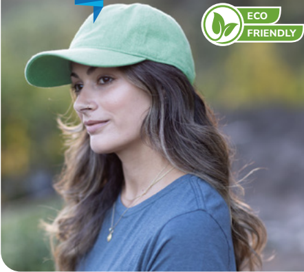
ECONSCIOUS UNSTRUCTURED ECO BASEBALL CAP