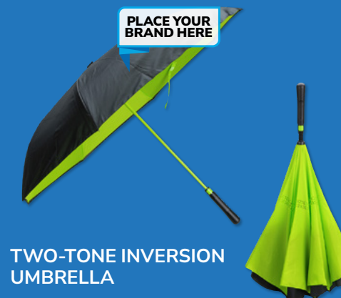
TWO-TONE INVERSION UMBRELLA