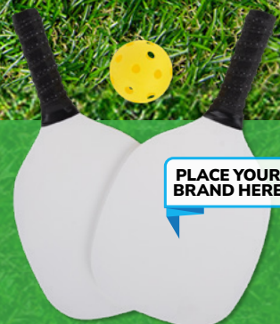
OUTDOOR PICKLE BALL SET

Includes two pickleball paddles with grips, one pickleball, and a mesh pouch with drawstring closure