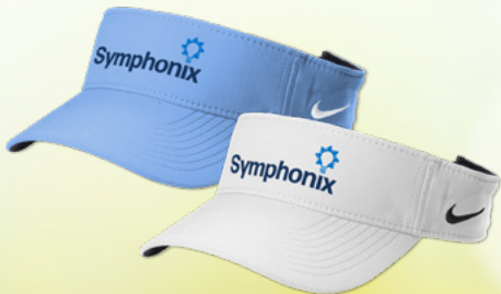
NIKE DRI-FIT TEAM PERFORMANCE VISOR