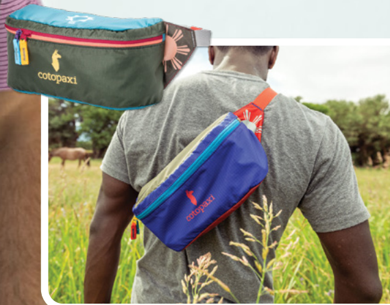
COTOPAXI BATAAN HIP PACK

SWANNIES GOLF MEN'S VANDYKE QUARTER-ZIP HOODED SWEATSHIRT