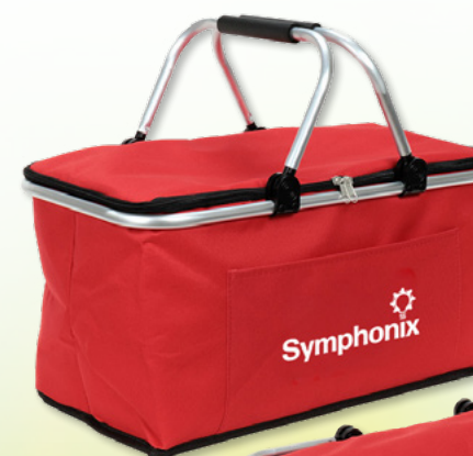
JAMBOREE INSULATED HARD FRAME PICNIC BASKET