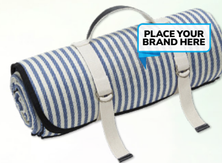
PRIME LINE HAMPTON OUTDOOR PICNIC BLANKET

Includes two pickleball paddles with grips, one pickleball, and a mesh pouch with drawstring closure