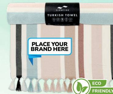
SLOWTIDE TURKISH COTTON TOWEL

Made of recycled PET fiber created from post consumer plastic. Add cool water to activate, simply snap to reactivate.